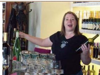
You know who...